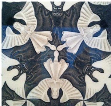
Angels and demons; MC Escher