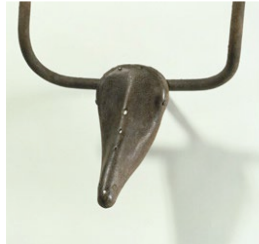
The Bull, Picasso