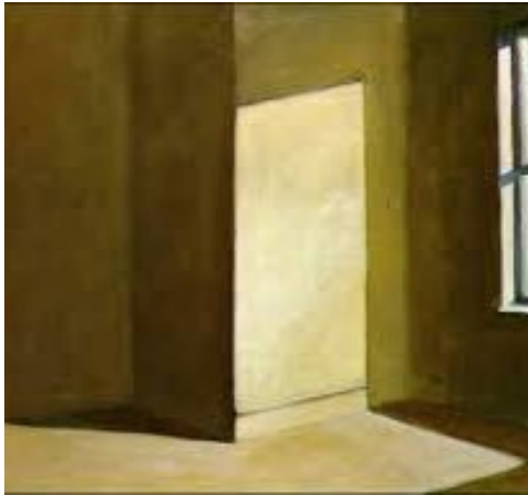
Sun in an empty room, Edward Hopper